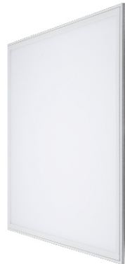
LED PANEL LIGHT