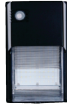
LED SMALL WALL PACK