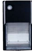
LED SMALL WALL PACK